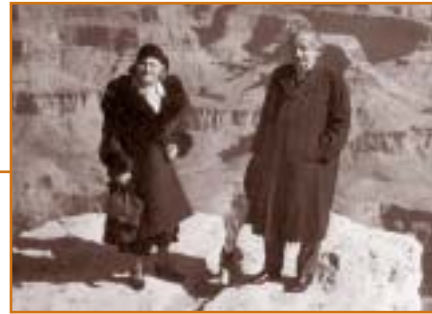
Famous Jewish Arizonan? Albert Einstein was among the state's winter visitors in February 1931. He stopped briefly at the Grand Canyon with his wife Elsa during a trip across the US.