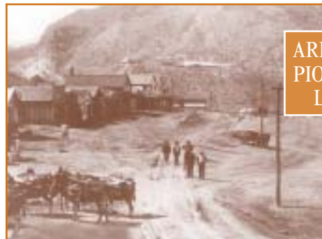
Building site of Roosevelt Dam, c. 1906. Includes Lantin store on left.