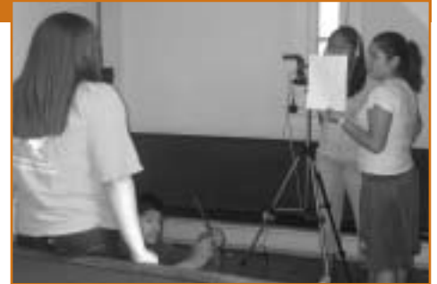
Students film narration for video, May 8, 2006.