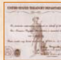
Commendation from U.S. Treasury Department to "Boys of Berney Park" for their efforts on behalf of the War Finance Program. Dated December 16, 1944.