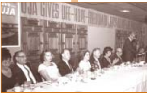
1967 Emergency Campaign for Israel.

The AJHS recently acquired over 1,000 historic photos from the Jewish Federation of Greater Phoenix , ranging in dates from 1948-1987. The photos include a variety of Federation activities, such as annual dinners, local events, and community missions to Israel. Below are samples from this impressive collection.