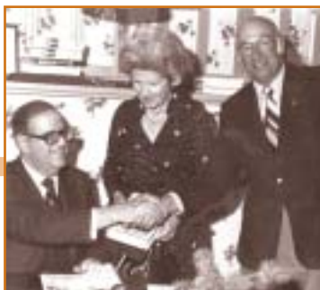
Dinner honoring Abba Eban, 1978.