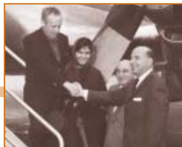
Greeting Leon Uriis for Annual Dinner, 1961.