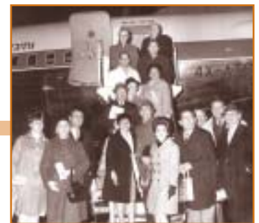
Federation Mission to Israel, 1960's.